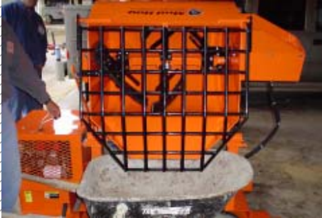
Dumps Into Wheelbarrow

This Little Piggy Just Came to the Market!