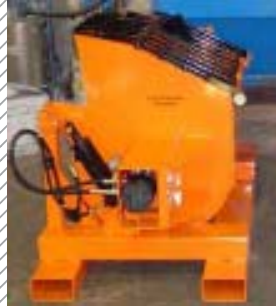
Fork pockets to lift