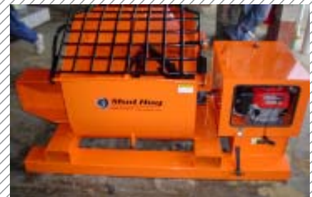
Loads low & Haul in a standard pickup truck